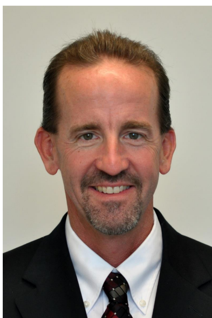
Dept. of Chemical Engineering University of California, Santa Barbara